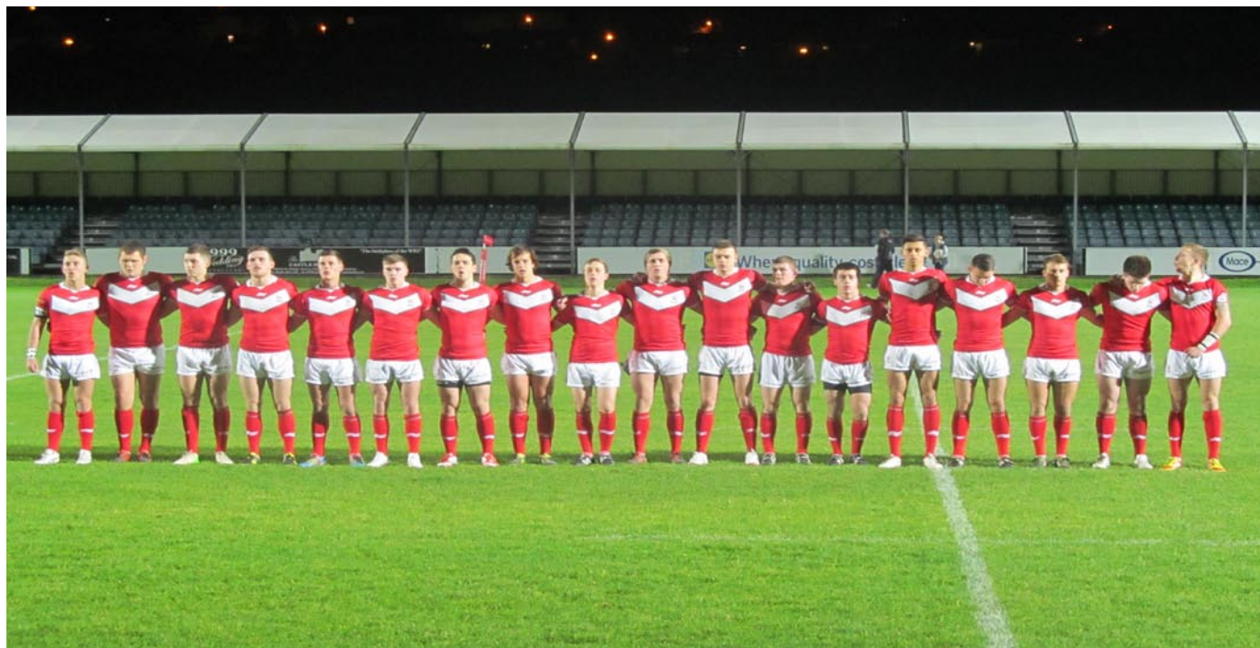
WALES UNDER-16 TEAM V AUSTRALIA INSTITUTE OF SPORT 2012