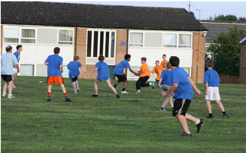
Street Rugby League takes the game into Estates

Street Rugby increased and developed in 9 areas across Wrexham, Flintshire and Denbighshire, 5/9 are structured areas and saw 80 registered members and 120 sessions delivered in disadvantaged areas.