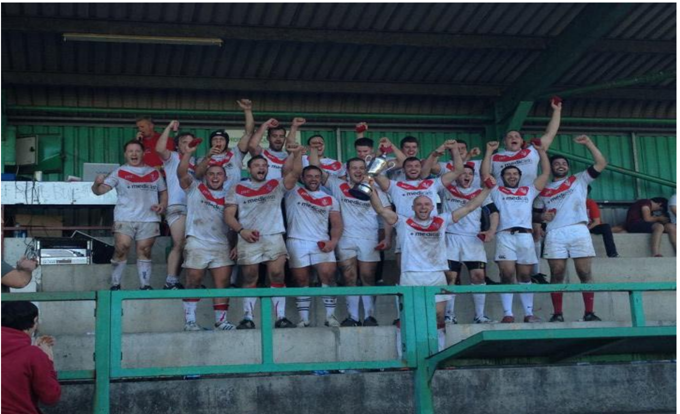
BONYMAEN BRONCOS WIN THE SOUTH WALES CONFERENCE GRAND FINAL